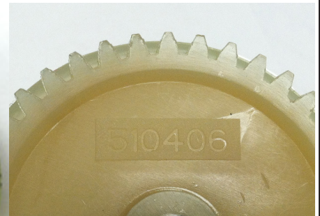
Figure 4. K3008 Distributor Gear Marked 510406 (Backside)

CHAMPION PROPRIETARY INFORMATION – Subject to the restrictions on the cover or first page