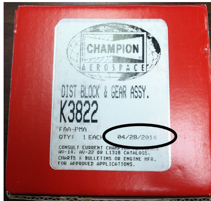
Figure 1. Replacement Kit Box Label Date Code

If it is not possible to confirm the version of the distributor gear that is installed in a given magneto from maintenance records, the magneto may be removed from the engine in order to have the housing and distributor block removed to allow visual inspection of the distributor gear. Distributor gears with Copper electrodes must be replaced with distributor gears with Monel electrodes.