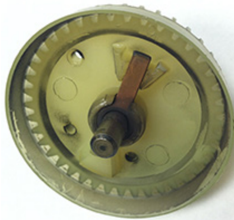
Figure 3. Affected K3008 Distributor Gear With Copper Electrode

COMPLIANCE: REMOVE the affected complete magneto and return to Champion for rework as soon as possible, not to exceed the next 50 hours. Document Service Bulletin compliance as written entry in applicable Aircraft and/or Engine logbook.