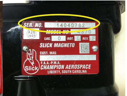
Figure 2. Magneto ID Label Date Code